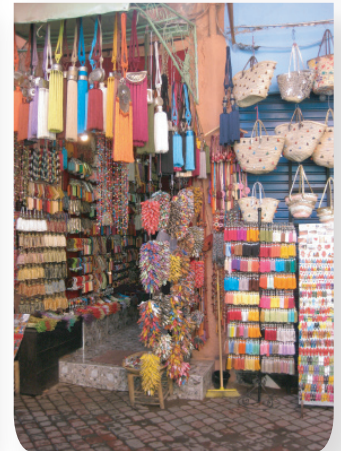
VISIT OF THE SOUKS