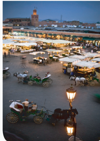
CALECHES CITY TOUR